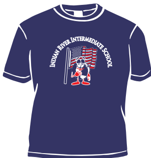
NAVY 50/50% T-Shirt FRONT LOGO