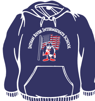
NAVY 8oz Hoodie FRONT LOGO