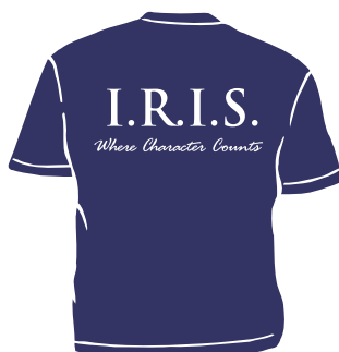
NAVY 50/50% T-Shirt BACK