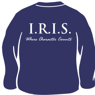
NAVY 50/50% L.S. T-Shirt BACK