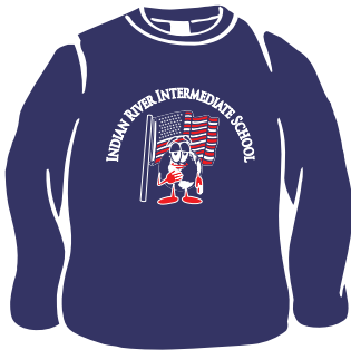
NAVY 50/50% L.S.T-Shirt FRONT LOGO